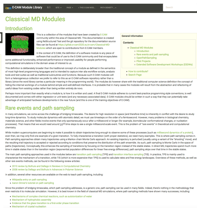
Figure 2: Example of one of the four scientific WPs repository of modules

An example of the landing page for the E-CAM library and the repository of the Classical MD WP can be seen in Fig. 1 and 2, respectively. The current template format for the submission of modules is available through the documentation pages as well as a description of how the software module is submitted .